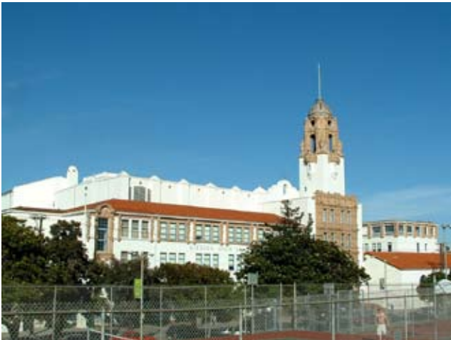
Historic Mission High School, San Francisco