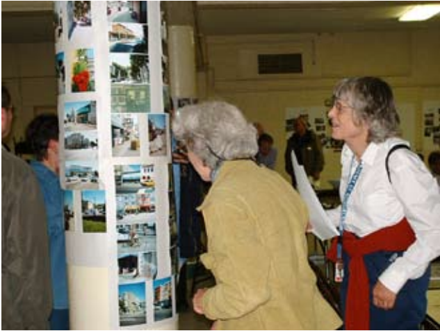
Seniors at Mission Street Community Planning workshop