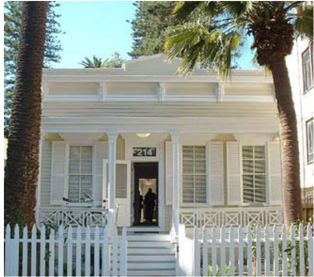
Historic Tanforan Cottage, San Francisco

Our experience as master plan architects for the Los Altos and Travis School Districts has also helped us develop ways of moving complex committees and competing needs forward in equitable programs. We expect to use all these skills and experiences in helping Piedmont chart its future Civic Center.